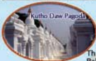
Kutho Daw Pagoda

Mandalay- The Last Dynasty of Myanmar, the center of cultural and religious significance is situated 668 km north of Yangon. The magnificent Old Mandalay Palace and Kuthodaw Pagoda