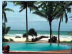
Ngwe Saung Beach