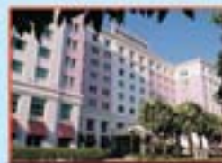
Grand Plaza Parkroyal Hotel