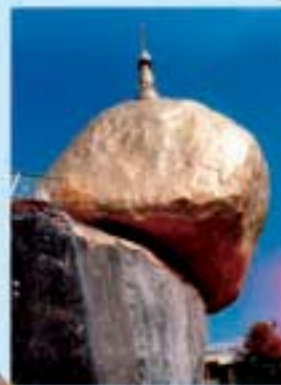
Golden Rock (Kyaikhtiyo)