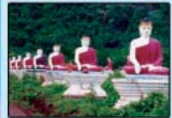
Pa-an Lungbini Garden

Golden Rock (Kyaikhtiyo)- One of the most interesting tourist destinations famous for its mystical pagoda stands on the gold gilded boulder, delicately balanced on the edge of the cliff which is over 1100 m above the sea level at Mt.Kyaikhtiyo. It is about 180 km from Yangon. Pa-an, the capital of Kayin State is famous for the fascinating Lungbini Garden with 1120 sitting Buddha images. Mudon, 30km from Mawlamyine, tourists will be amazed to meet about 200 standing statues of monks carrying alms-bowls along the long street in the Win Sein Tawya garden.