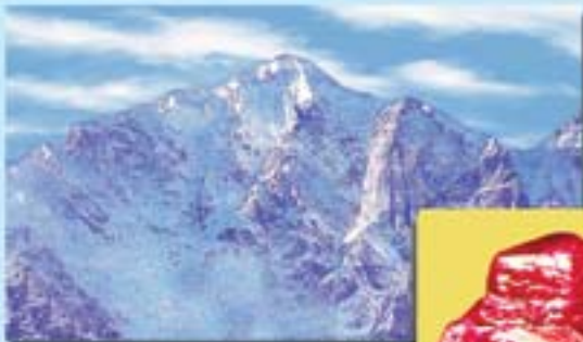
Snowcapped Mt. Hkaka-bo-razi