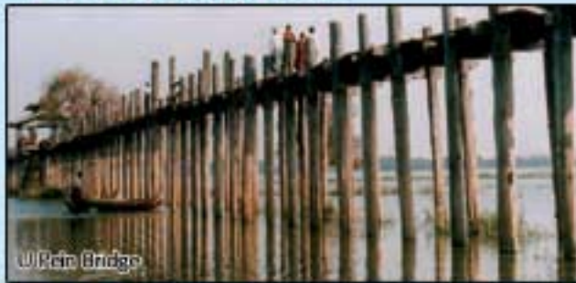
U Pein Bridge