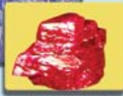
The World Biggest Ruby

Myitkyina is situated in Kachin State, the top most mountain region, 779km north of Mandalay. The town is proud of its confluence of the two tributaries Maikha and Malika rivers known as the famous place called "Myitsone". Indawgyi Lake is the largest lake in Myanmar and famous for Ecotourism. Only during the festival period, the new village with several thousands dwellers suddenly appears on the lake. Putao is called "Switzerland of Myanmar" and the nearest town to the base camp for climbing Mt. Hkaka-bo-razi (5889m), the highest mountain in South East Asia. Mogok & Hpakant, both towns produced the world Biggest stone of Ruby (21,450 carats) and the largest Jade stone (over 3,000 tons) in the world.