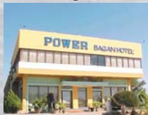
Bagan Power Hotel