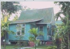
Sweet Golden Land Hotel